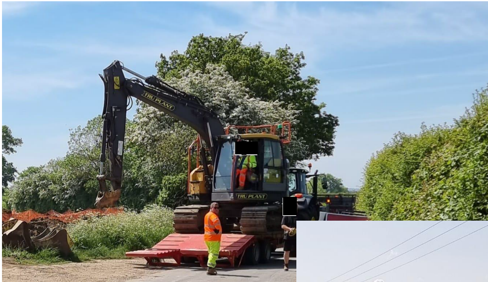
Grove Road May 2021 (above) Grove Road October 2020